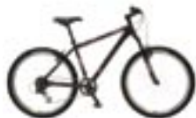
COLOR OPTION : Gloss Amethyst