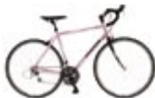
COLOR OPTION : Gloss Pink