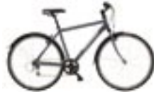
COLOR OPTION : Matte Steel

Forged Alloy Linear Pull with Front Power Modulator