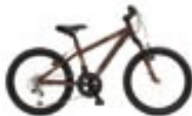
COLOR OPTION : Matte Red Rock