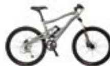
COLOR OPTION : Gloss Pewter