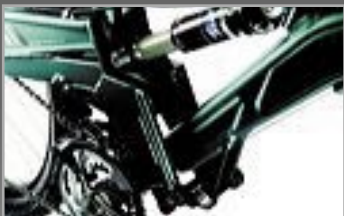
Q U A D T A R A