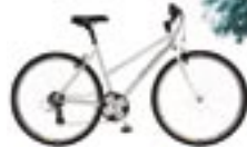
STEP-THRU : Gloss Brushed Polish