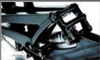
Q U A D X C