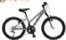
STEP-THRU : Matte Vapor