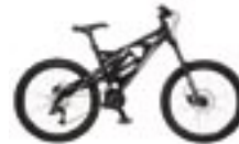
COLOR OPTION : Gloss Black Pearl