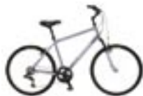
COLOR OPTION : Gloss Slate Blue

Forged Alloy Linear Pull with Front Power Modulator