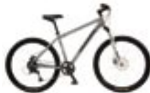
COLOR OPTION : Gloss Mica