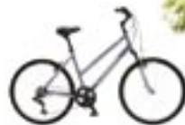
STEP-THRU : Gloss Slate Blue