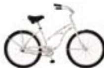
SINGLE SPEED OPTION : Gloss Pearl