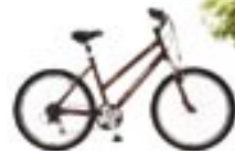
STEP-THRU : Gloss Red Rock