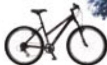
STEP-THRU : Gloss Amethyst