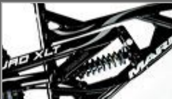
Q U A D X L T