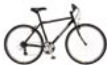
COLOR OPTION : Gloss Black Pearl