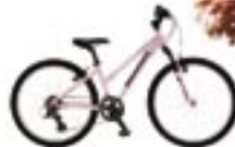
STEP-THRU : Gloss Pink