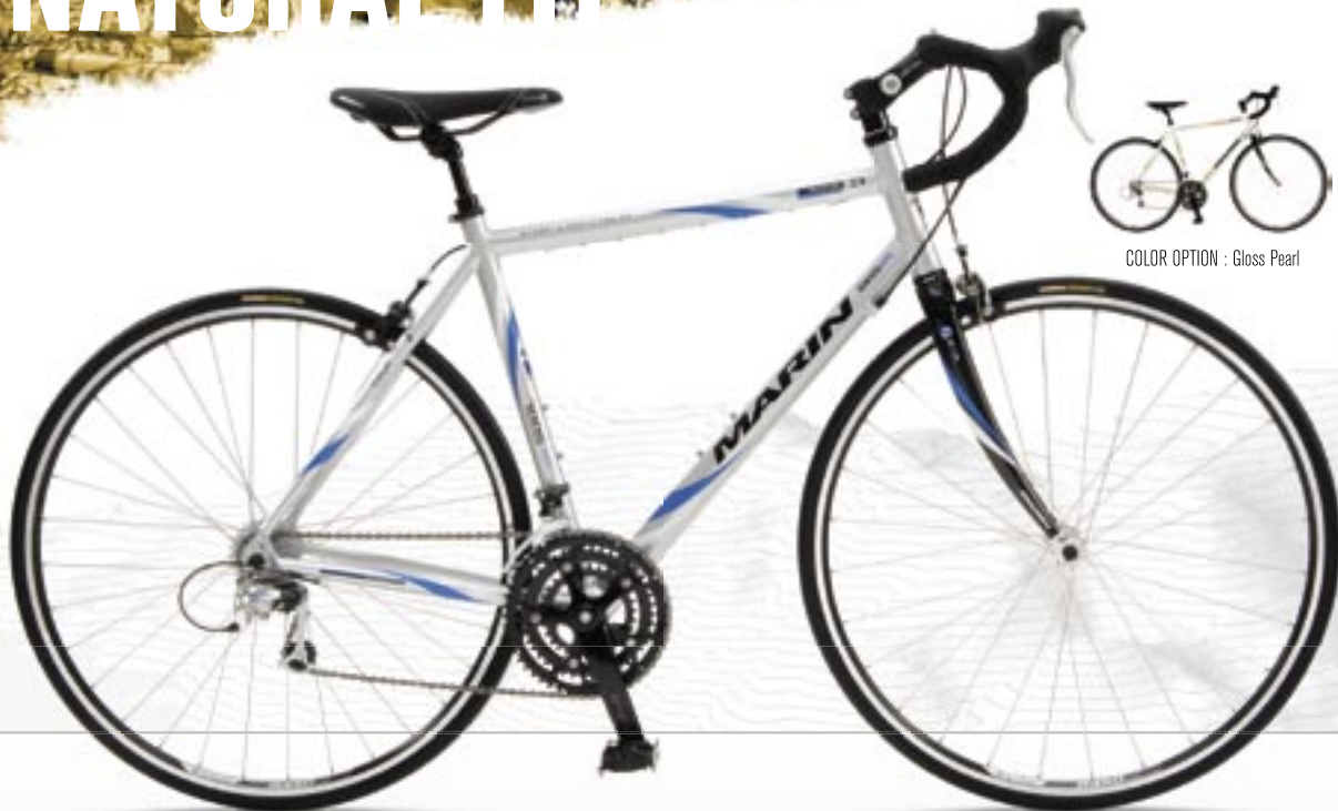
COLOR OPTION : Gloss Pearl