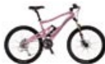
COLOR OPTION : Gloss Pink