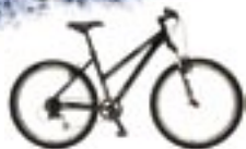
STEP-THRU : Gloss Black Pearl