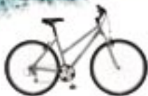
STEP-THRU : Gloss Mica