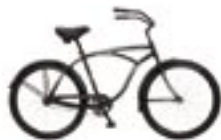
SINGLE SPEED OPTION : Matte Coal