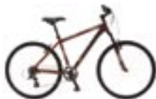
COLOR OPTION : Matte Red Rock