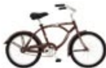
Boy's Cruiser Option : Gloss Red Rock