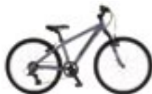
COLOR OPTION : Gloss Steel