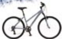
STEP-THRU : Matte Slate Blue