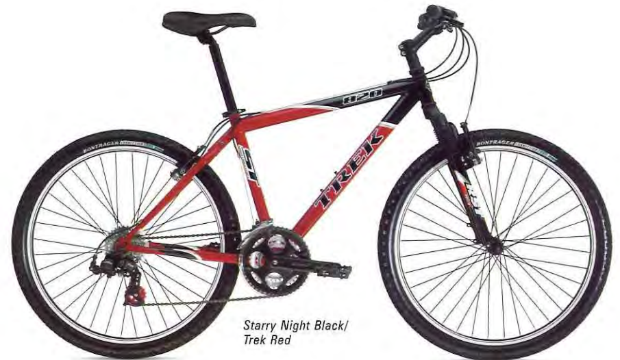
Starry Night Black/ Trek Red