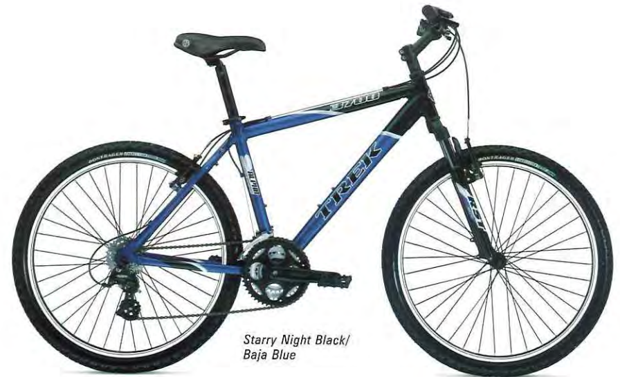
Starry Night Black/ Baja Blue