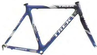
Nude Pearl/Baja Blue (Team) (Also available in Nude Carbon)

Our proprietary superlight Trek OCLV™ Carbon creates the strongest, fastest and most durable stock frame out there. Because Trek OCLV Carbon is directional, we can shape it to soak up vibration in one area and be stiff for better power transfer in another. To complete the performance package we've included an aerodynamically designed OCLV carbon fork. The result is a ride with the speed, agility and precision a Tour champion demands.