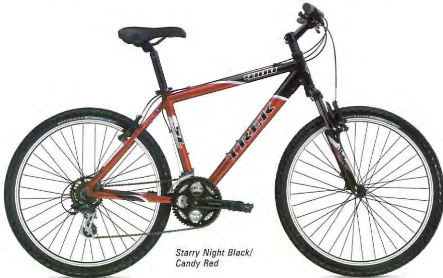
Starry Night Black/ Candy Red

4100™ Frame Alpha SL aluminum Front Suspension InSync 320 Wheelset Alloy hubs; Matrix 550 rims; 14G ss spokes Crank SR XCC100 48/38/28 Rear derailleur Shimano Acera Sizes 13, 16, 18, 19.5, 21, 22.5"; W 16"