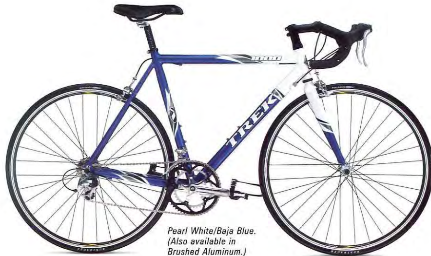
Pearl White/Baja Blue. (Also available in Brushed Aluminum.)