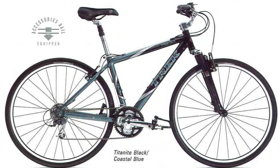
Titanite Black/ Coastal Blue

7500 FX™ Frame Alpha SL aluminum Fork Aluminum Wheelset Bontrager Select Crank Bontrager Select 48/38/28 w/ISIS Rear derailleurs Shimano Deore LX Sizes 15, 17.5, 20, 22.5"