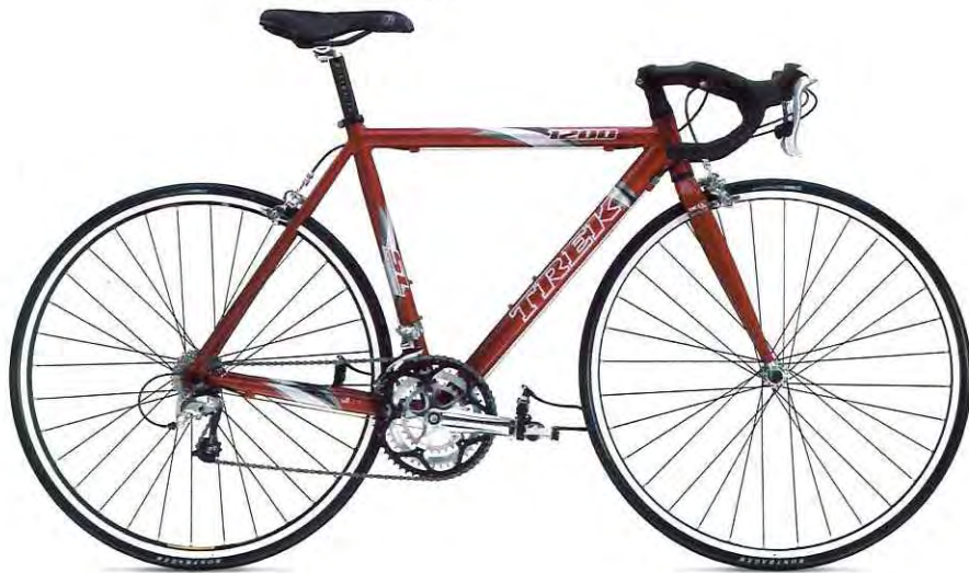
1200™ Candy Red