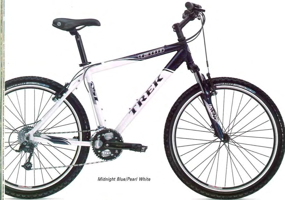
Midnight Blue/Pearl White

IF YOU STILL KNOW WHERE YOU ARE, YOU HAVEN'T GONE FAR ENOUGH.