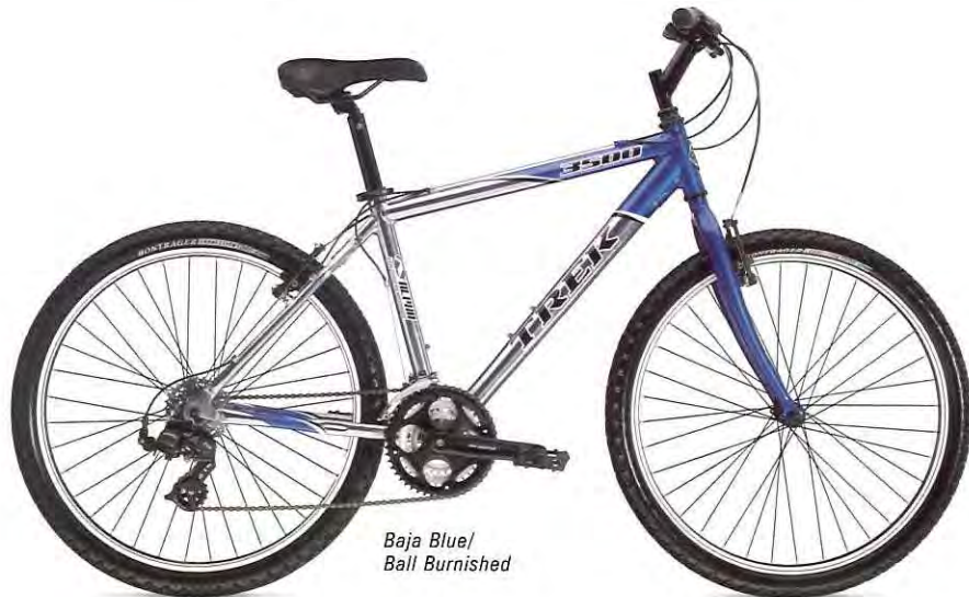
Baja Blue/ Ball Burnished