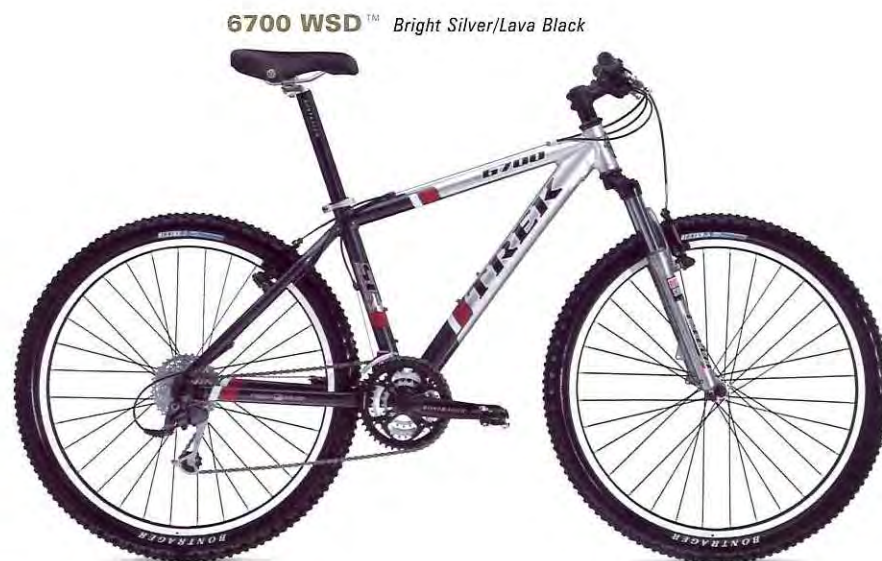
6700 WSD™ Bright Silver/Lava Black

Frame ZR 9000 Front Suspension RockShox Duke XC Rear Suspension Fox Float R w/Pro Pedal Wheelset Bontrager Select Crank Bontrager Race 44/32/22 w/ISIS Rear derailleur Shimano Deore XT Sizes 14, 16, 18"