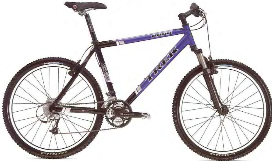
8000™ Baja Blue/Starry Night Black