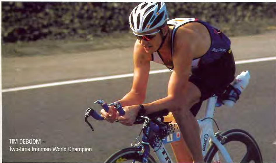
TIM DEBOOM – Two-time Ironman World Champion