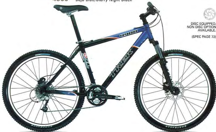
4900™ Baja Blue/Starry Night Black