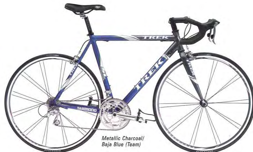
Metallic Charcoal/ Baja Blue (Team)

1500™ Frame Alpha SL aluminum Fork Bontrager Race Carbon Wheelset Bontrager Select Crank Bontrager Race 52/42/30 w/ISIS Rear derailleur Shimano Ultegra Sizes 52, 54, 56, 58, 60, 63cm