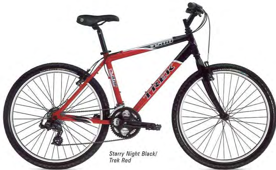
Starry Night Black/ Trek Red