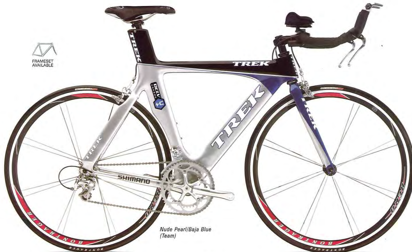
Nude Pearl/Baja Blue (Team)