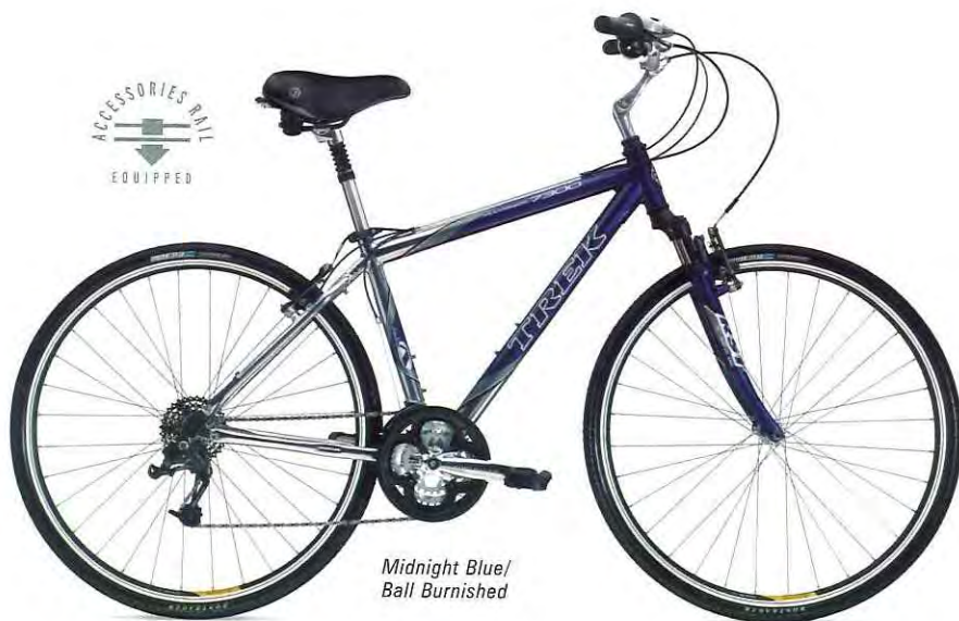
Midnight Blue/ Black Burnished

7300™ Frame Alpha aluminum Front Suspension RST CT COM I T4 Wheelset Alloy F, Shimano C201 R hub; ACE19 rims Crank Bontrager Sport 48/38/28 Rear derailleur SRAM X.7 Sizes 15, 17.5, 20, 22.5, 25"; Women's 15, 17.5, 20"