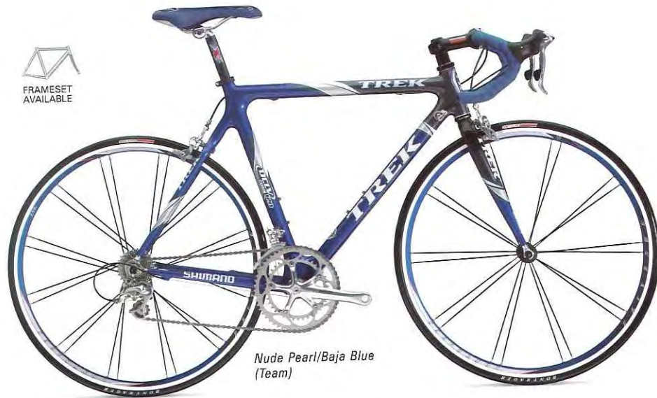
Nude Pearl/Baja Blue (Team)