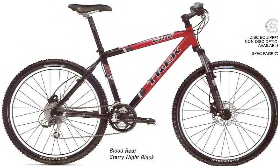
Blood Red/ Starry Night Black