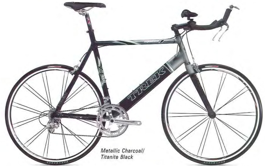
Metallic Charcoal/ Titanite Black

Frame OCLV HC Carbon Fork Bontrager Aero TT Wheelset Bontrager Race Aero Crank Shimano 105 53/39 Rear derailleur Shimano Ultegra Sizes S52, M56, L60cm