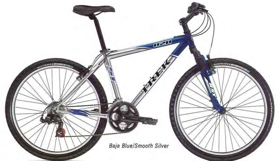
Baja Blue/Smooth Silver