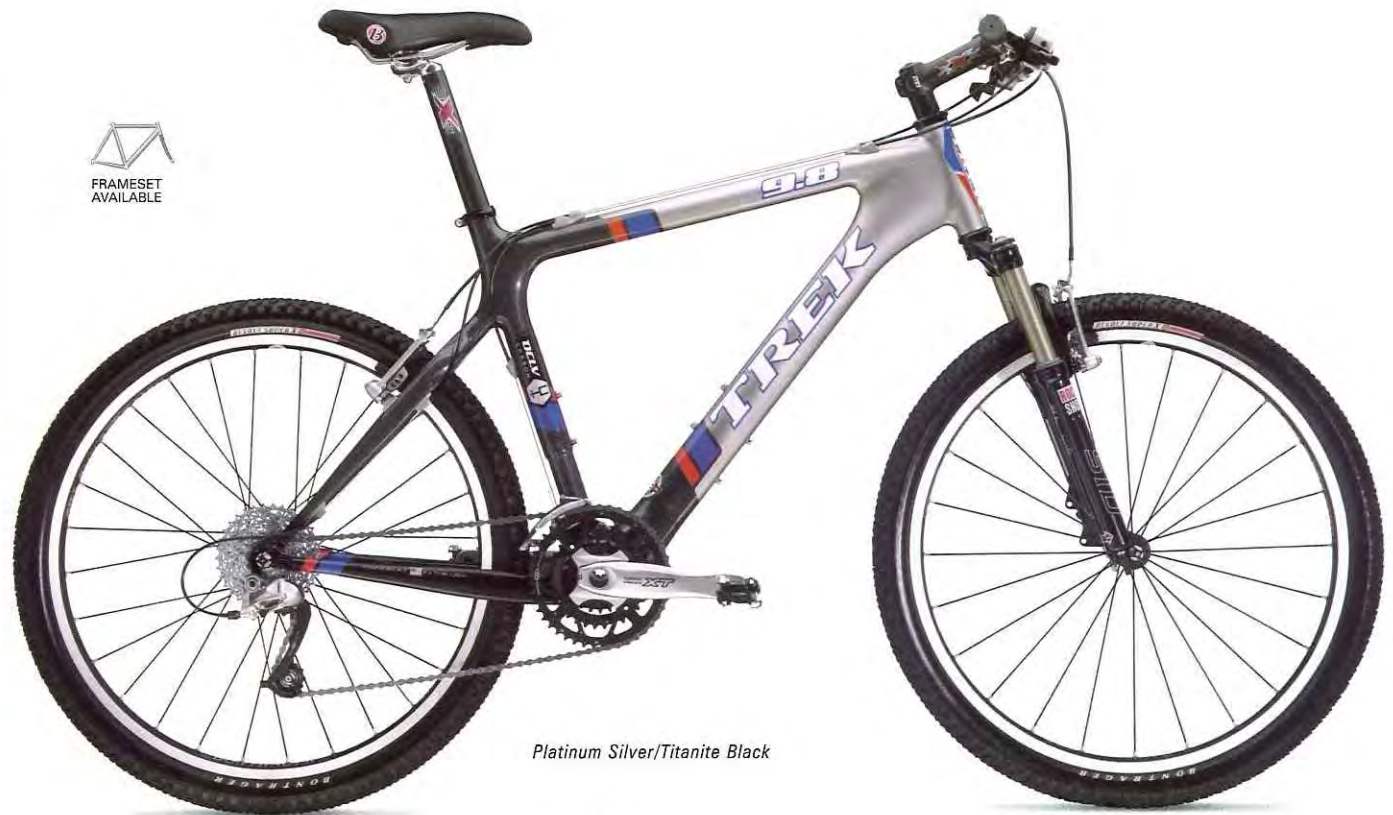
Platinum Silver/Titanite Black