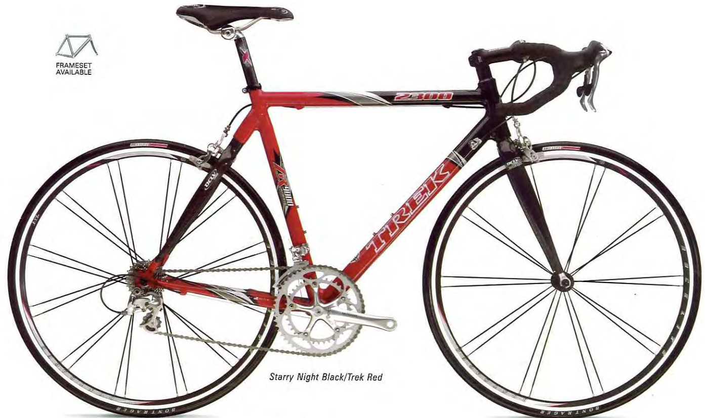
Starry Night Black/Trek Red