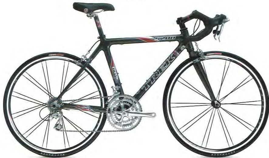
5200 WSD™ Nude Carbon