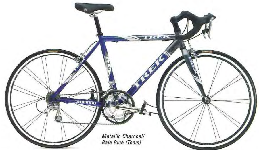
Metallic Charcoal/ Baja Blue (Team)