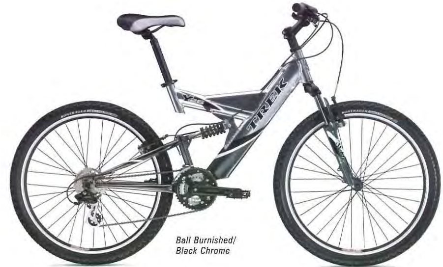
Ball Burnished/ Black Chrome

MEN'S AND WOMEN'S FRAMES AVAILABLE IN BOTH COLORS.