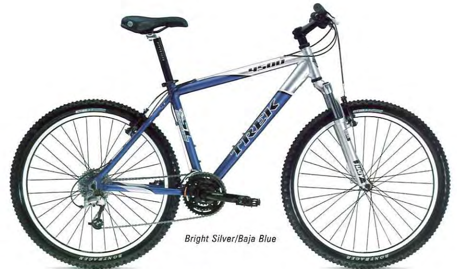
Bright Silver/Baja Blue

4500™ Frame Alpha SL aluminum Front Suspension RockShox Judy TT Wheelset Alloy front, Shimano rear hub; Matrix 750 rims Crank Shimano MC08 42/32/22 Rear derailleurs Shimano Deore Sizes 13, 16, 18, 19.5, 21, 22.5, 24"