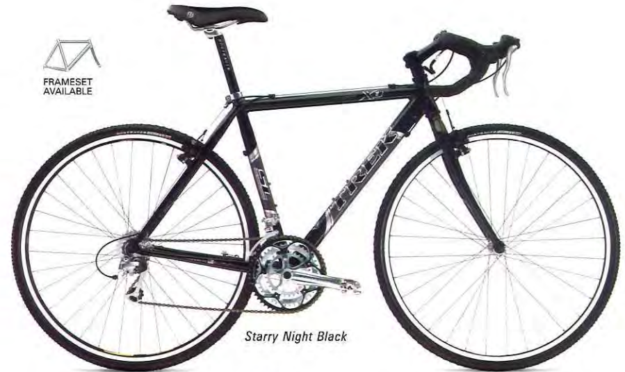
Starry Night Black