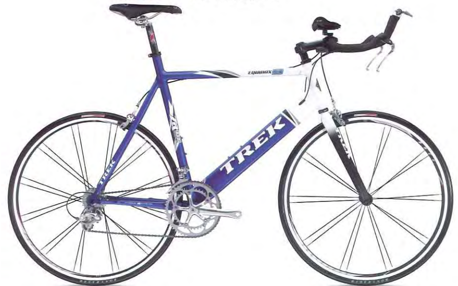
Equinox™ 9 Pearl White/Baja Blue