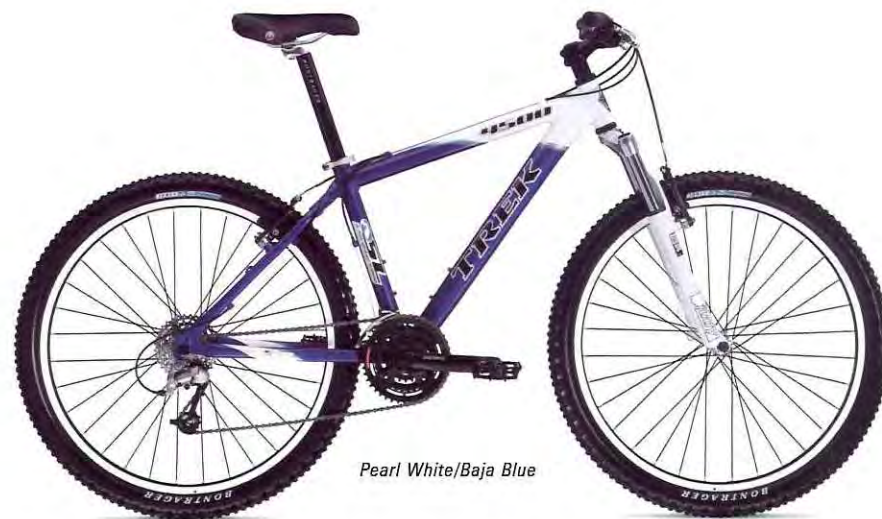
Pearl White/Baja Blue