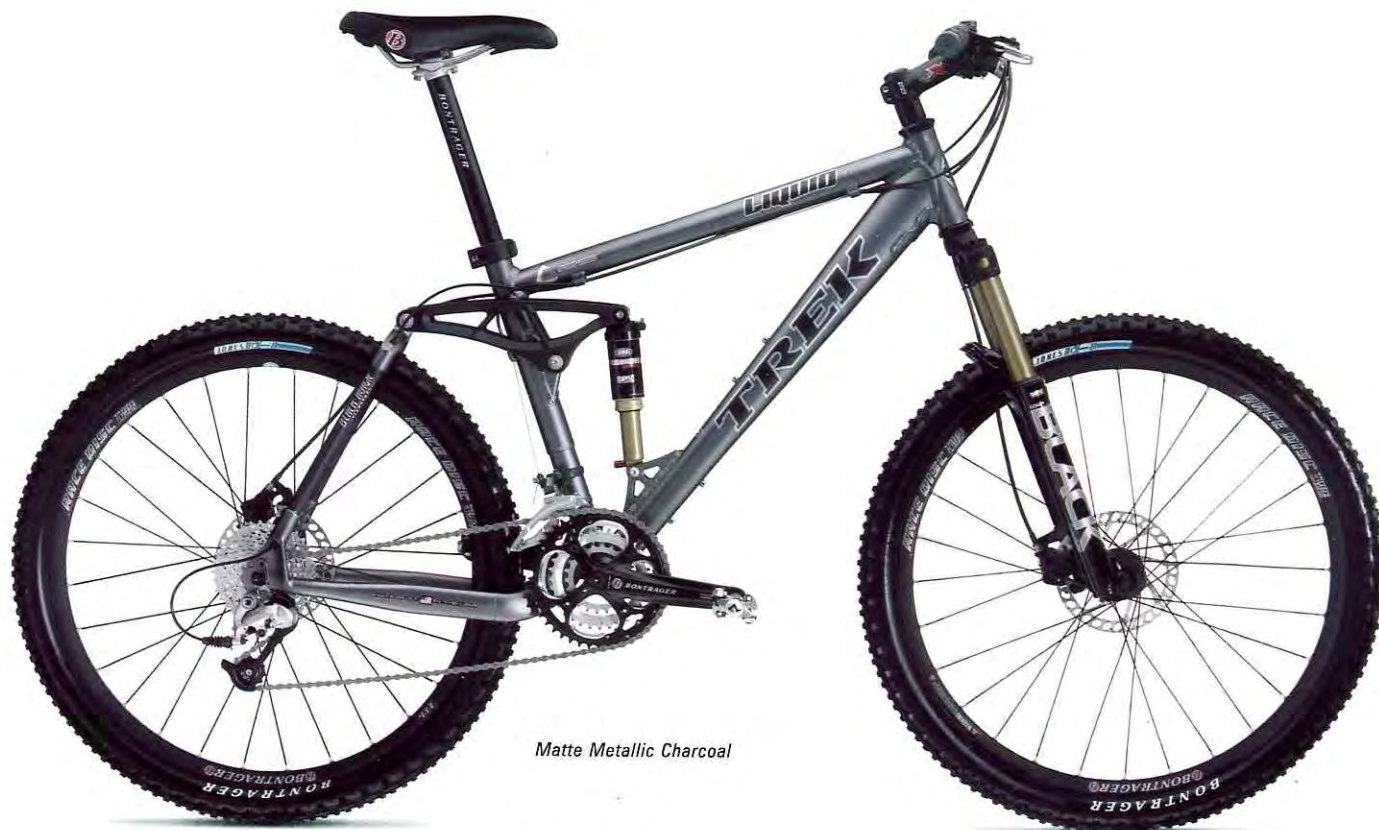
Matte Metallic Charcoal