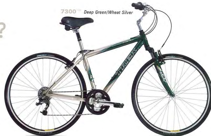
7300™ Deep Green/Wheat Silver