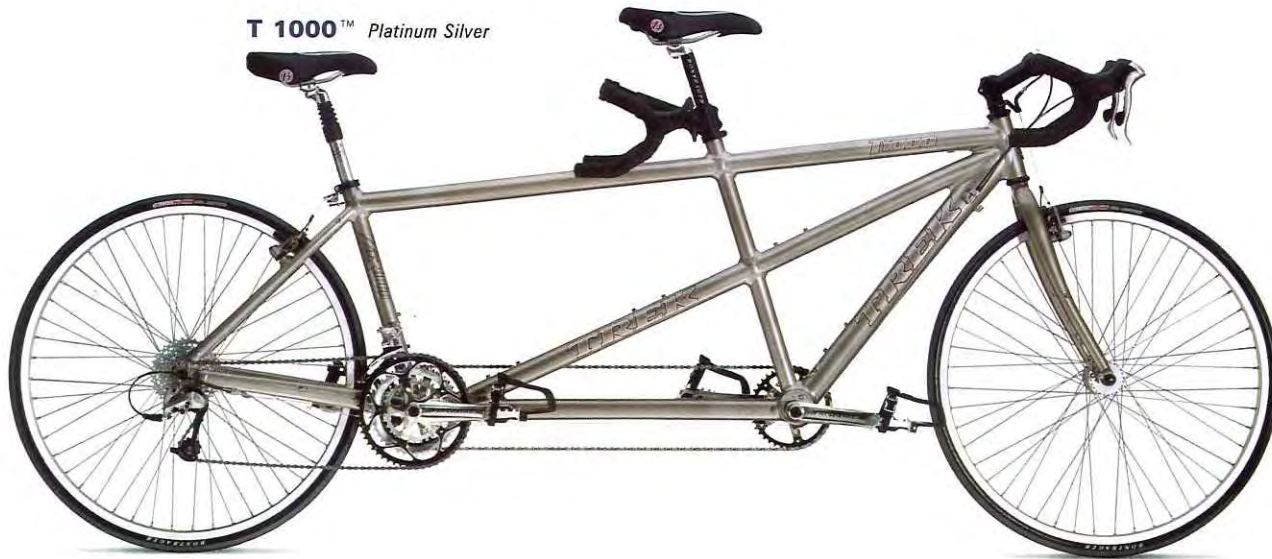
T 1000™ Platinum Silver