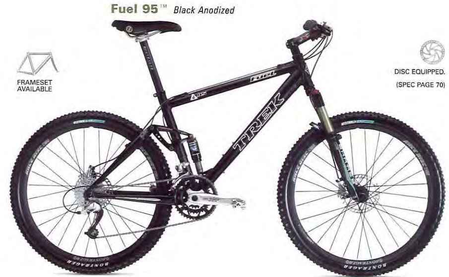
Fuel 95™ Black Anodized