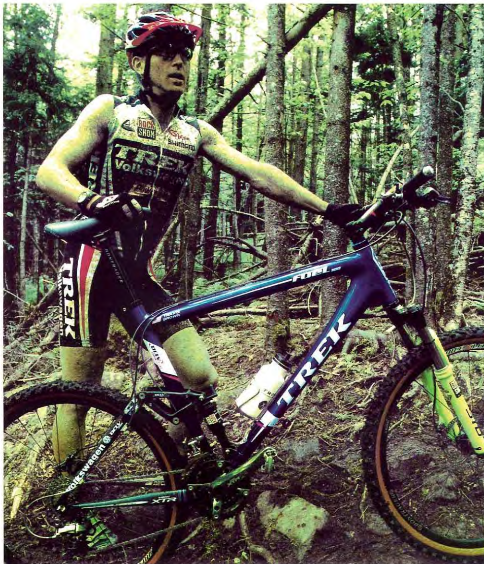
Fuel 80™ Brushed Aluminum

These full suspension bikes are made for rugged use. The performance position allows you to aggressively go downhill or take on rolling straights. Tunable shocks front and rear absorb the bumps while providing you with incredible feel and response. Wherever you end up, you're bound for a fun ride.