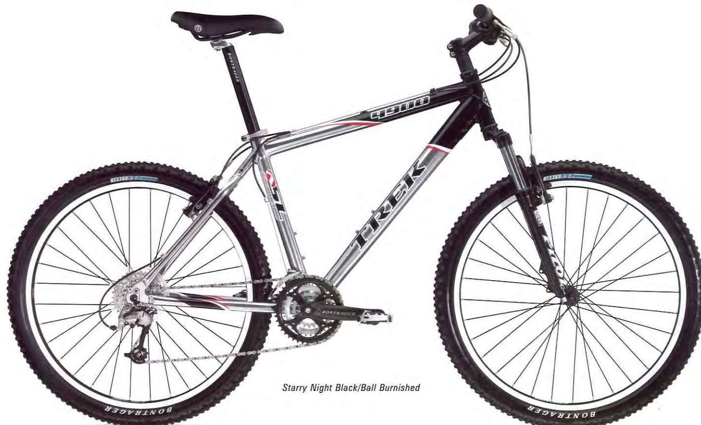
Starry Night Black/Ball Burnished

From singletrack trails to potholes in the city, these powerful Trek hardtails aren't afraid to flex some off-road muscle. The slightly higher hand position and versatile frame geometry give you a ride that lets you shift from all-purpose trails to singletrack with confidence.