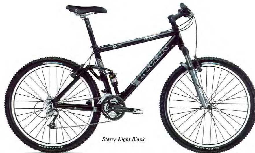
Starry Night Black

Fuel 80™ Frame Alpha SL aluminum Front Suspension RockShox Pilot SL Rear Suspension RockShox BAR Adjust Wheelset Alloy front, Shimano rear hub; Maverick rims Crank Bontrager Select 44/32/22 w/ISIS Rear derailleur Shimano Deore LX Sizes 15.5, 17.5, 19.5, 21.5"