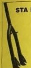
STA Forks w/990's