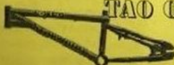
TAO OF GROUND

Lengthy Top Tube:20.5" Wheel Base:37" Chain Stays:14.4" HeadTube Angle:74.5 Seat Tube Angle:71