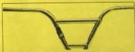
6 Piece Bars