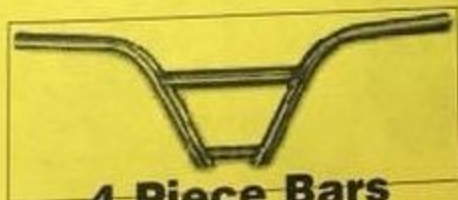
4 Piece Bars