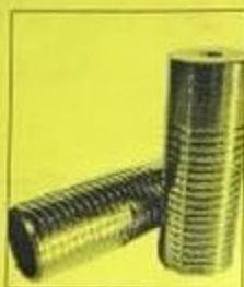
Spaced Thread Pegs