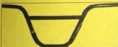
2 Piece Bars