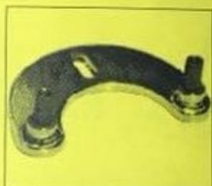
990 Brake Plate