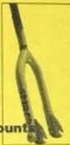
STA Forks peg mounts