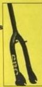
STA Forks w/peg mounts & 990's