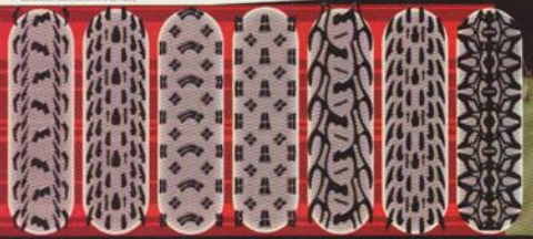
GORDO (29" FRONT 26 X 1.75) GATOR (29" FRONT 26 X 1.7) FAULT LINE (29" FRONT 26 X 1.7) DRIFTER (26 X 1.7)

You're looking at the world's first "Race Training" tire.