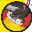
Dia-Compe pioneered threadless headset technology for mountain bikes. Oversized sealed bearings and CNC-machined alloy construction make the Cane Creek AheadSet on the DBR Team Issue the finest available.

quarter inches. When riding conditions demand it—say, during prolonged ascents—a manual shock lockout lets you neutralize the suspension for more direct power transfer. For riders who prefer the instant acceleration available only on a hardtail, this year's DBR Team Issue features one of the fastest Easton aluminum framesets on the World Cup circuit.