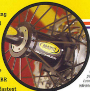
Mavic's Crossmax rear hub utilizes straight-pull spokes for greater wheel strength and double freewheel points for more positive power transfer under heavy hammering. Our team riders' race machines feature the same advanced wheel system.