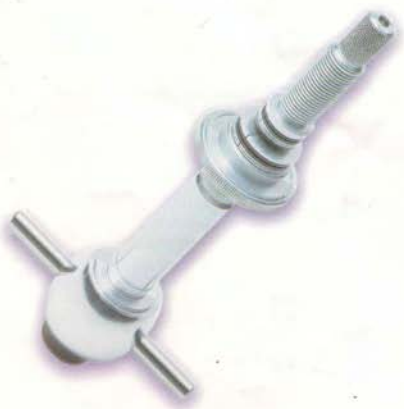
HUB BEARING TOOL