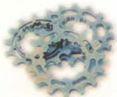
King BMX Cogs