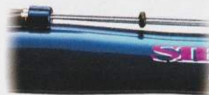
MAX PRINCIPLE AND OUTER BUTTING

Sport series offers a lowered rearfork construction which prevents damage to the frame by the chain. Giant thinks it's only natural that in this branch of sport the cables for gear-shifting and braking