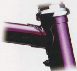
MICROFUSION LUG AND DOUBLE BUTTED TUBES

according to the double-butted principle. By adapting the butting to the frame height, a guaranteed butt length always remains at the outer ends of the tubes. As a result, the frame tubes are thick where it's needed (0.9 mm at the welds) and thin where it's possible (0.6 mm in