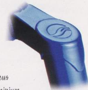
BOXER FRONT FORK