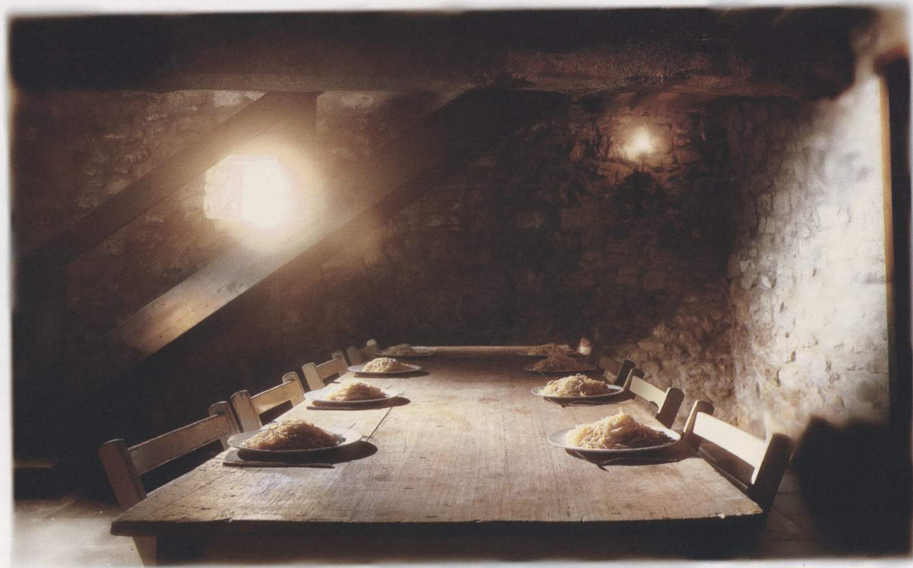
7.15 A.M.: BREAKFAST AT LA ROCHE EN ARDENNE