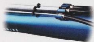
TOP-FITTED BREAK- AND GEARSHIFT CABLES

the seat tube ensures an optimum saddle-pin fit. Result: assembly free from play, no excessive luxury