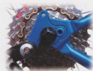
REPLACEABLE REAR DROPOUT

series, you'll notice the attractive yet solid manner in which the welds have been made. Thanks to the Boxer front fork, you can keep your bike better under control 'in the wilds'.