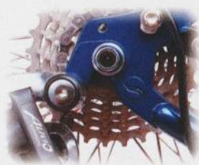
LOWERED REARFORK CONSTRUCTION