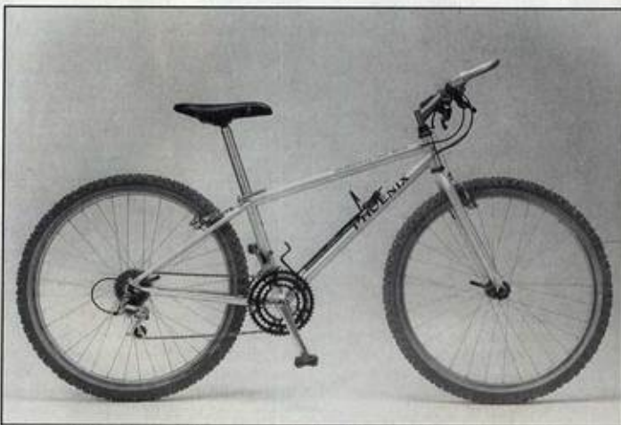
The radically sloping top tube on our smaller test bike created a good amount of standover height for our smaller test riders. Fairly standard angles with a longish fork trail create a more stable than aggressive bike for most trail riding situations.

One thing that surprised us was the rigidity of the bikes, despite the thin wall tubing. The reduced weight and length of the frame tubes, along with