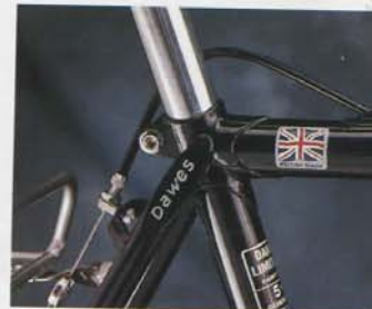
Seat cluster with internal cable routing, and oversized seat post - for increased rigidity.