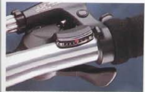
Deore XT Rapidfire Plus gear shifters