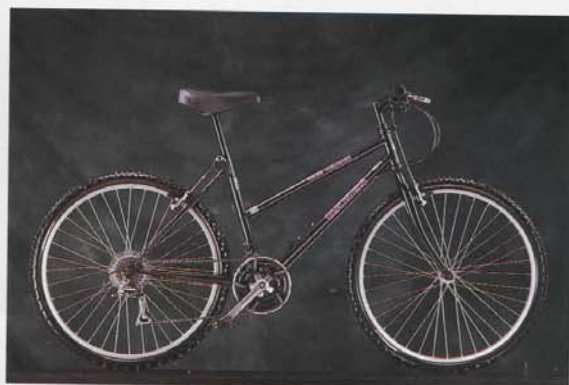
One Track ladies