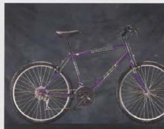
Tempest - adult frame style

Quality that's reflected in both the components we select and our hand-finishing of every ZED model. For details, ask your local Dawes dealer or contact us at the address overleaf. Some examples are: