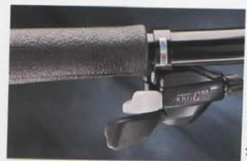
Altus C10 Rapidfire Dual Repeat gear shifters