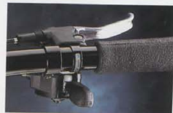
Altus C50 Rapidfire Unilever

DAMAGE LIMITATION PAINT SYSTEM 5 YEAR GUARANTEE