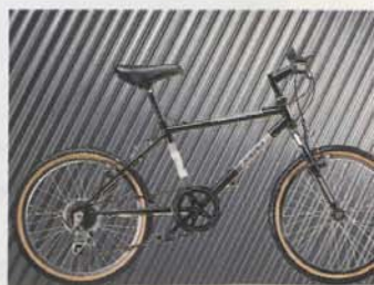
Predator - kids frame style