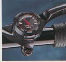
Tourney 30 shift lever with d Gear Display