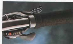
STX Rapidfire Plus gear shifters with Optical Gear Display