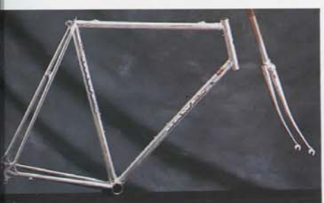
available, Linear framesets supplied with headset fitted.