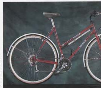
Back Street ladies

Colour co-ordinated ATB bars. Vette Foam saddle. Alloy pillar & stem. Beantop pedals. Chrome mudguards.