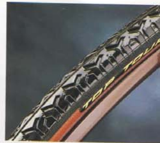
Continental Top Touring tyre - with an extra puncture resistance.