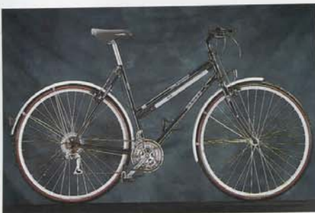
Street Sharp ladies

STX parallel Q/R hubs. Alesis 917 box section 700C rims. Stainless spokes. Continental City Grip tyres.