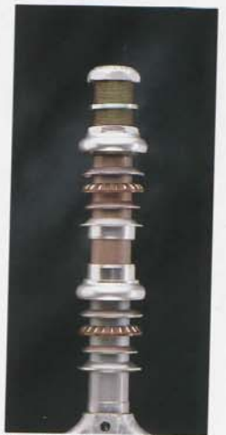
Stronglight A9 sealed roller bearing alloy headset - ultra smooth and hard wearing.