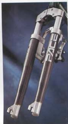
Pace RC-35 suspension