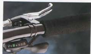
Alivio Rapidfire-L gear shifters with Optical Gear Display