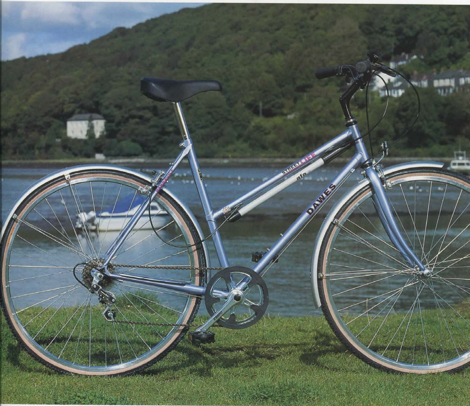
Street Life 18 ladies