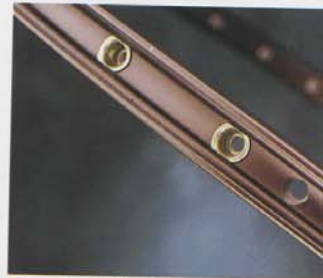
Box-section, double eyeletted rim - for added strength.