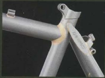
Fillet-brazing is a highly skilled method of joining tubes, which eliminates the need for lugs. The result is a lighter frame.