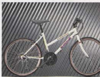
Zig Zag - ladies/girls frame style

Please send me your 1995 Dawes catalogue when it becomes available.