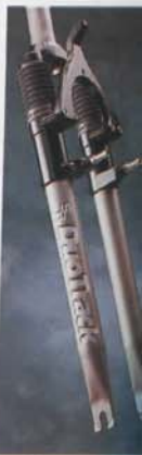
SR Duo Track suspension

Cr Mo titanium finish stem & bars. Oversize Ritchey headset. Alloy bar ends. Vette SE saddle. Lite alloy pillar & Q/R. Alloy pedals.