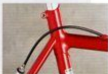
Extended lugless seat tube

Our lightweight custom cycles are ridden to regular success in the B.B.A.R.