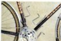
3 water bottle cage fittings