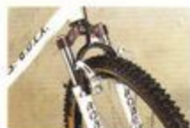
Optional special geometry for suspension forks

ROBERTS Handbuilt Lightweight Cycles and Frames