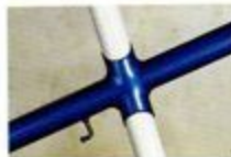
Reinforced seat tube joint