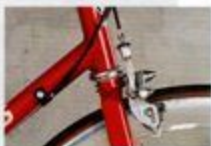
Tear drop aero forks