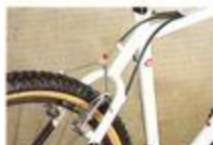
Unique one piece horseshoe rear stays