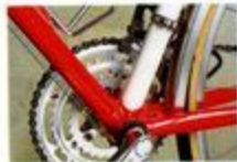
Cast bottom bracket shell

ROBERTS Handbuilt Lightweight Cycles and Frames