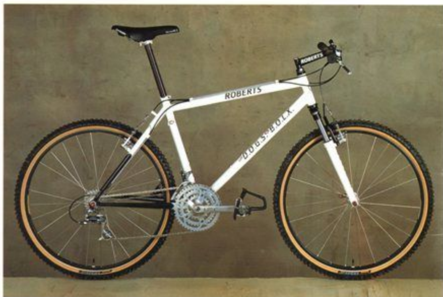
The D.O.G.S. B.O.L.X.

We built the first mountain bikes in Britain and we have stayed at the cutting edge of technology ever since. New ideas are incorporated into every frame we build.