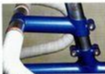
Custom stoker stem

The ATB Tandem frame is an excellent base for a heavy duty expedition frame.