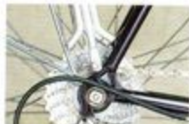
Vertical dropouts, double eyes front and rear