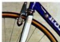
Special Columbus tear drop blades on Master Pro Max

"The workmanship is flawless, the performance is excellent and the materials are lavish top quality stuff" BICYCLING USA