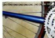
Special oversized tandem chainstays

ROBERTS Handbuilt Lightweight Cycles and Frames