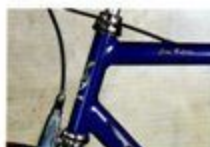
Fillet brazed hand filed and polished joints on lugless frames

ROBERTS Handbuilt Lightweight Cycles and Frames