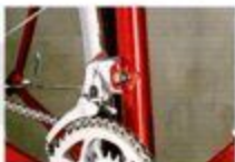
Genuine Campagnolo cast braze on front changer boss

ROBERTS Handbuilt Lightweight Cycles and Framesets