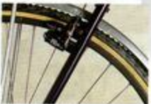
19mm seat stay for extra rigidity

ROBERTS Handbuilt Lightweight Cycles and Frames