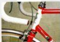
Side pull or cantilever brakes