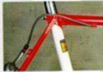
Light cast seat lug and rack fittings