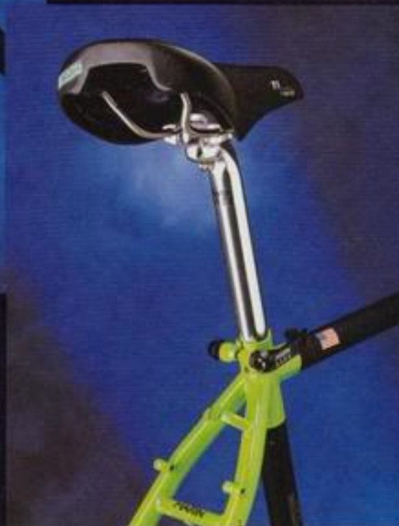
MARIN LITE SADDLE, SEATPOST AND Q.R.