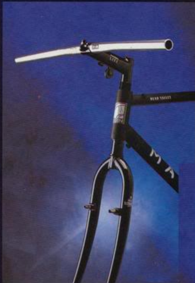
MARIN LITE HANDLE BAR, STEM AND FORK

For '92 we have made our super light weight components available separately. Now everyone can benefit from the weight savings that these high quality, durable parts offer.