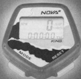
— \ BC-780-01 KING NOVA