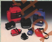
Wedge pack, wet/dry pack, expanding wedge, seat pack, fanny pack, combination fanny/handlebar bag, and front & rear panniers

A dvent Performance Products are designed by cyclists for cyclists. Each product offers unique features, excellent quality, and superior value. Attention to detail in fit, finish, and function ensures years of use and enjoyment.