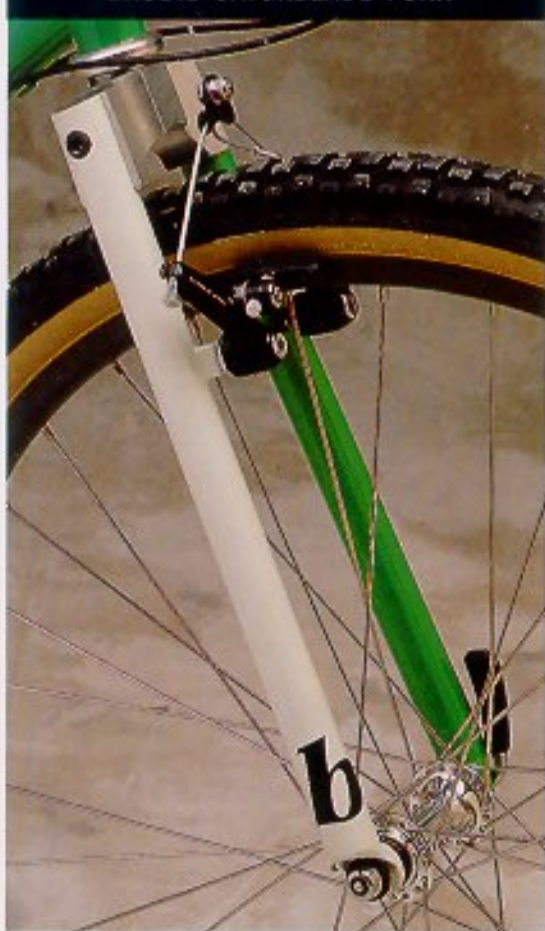
BRODIE GATORBLADE FORK

The fork that Mountain Bike Action acclaimed as "One of the most innovative designs of 1989" has significant improvements in strength and performance in 1990. A new cromoly fork blade, exclusive to Brodie, with a 1" diameter and a 1.1mm-0.7mm wall is joined to a special investment cast dropout. The precision machined T6 6061 aluminum crown is heated and joined to the reinforced cromoly steerer, then cooled, effecting a permanent union. The blade is inserted and locited in place with 10mm cromoly bolts. Testing proves that GatorBlades are at least two times stronger than the best welded or brazed joint. Union Power.