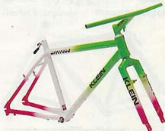
Suggested Retail Price for Attitude frame alone