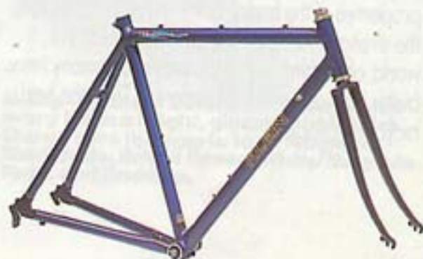
Suggested retail price for Performance frame

Suggested retail prices for complete bicycles: Performance Sport (105 group) 9,307 Performance Super Sport (Ultegra) 8,898 Performance Delux Sport (Dura Ace or Chorus) 8,742 See page 8 for components