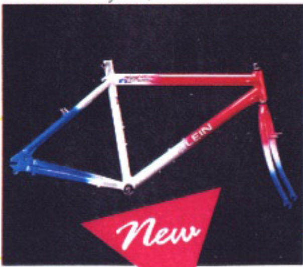
TOP GUN .....$895 Frameset only (18, 20 & 22)