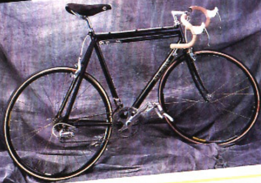
QUANTUM ELITE CHORUS (odd sizes 51-63cm) approx. 19.5 lbs. $1,995