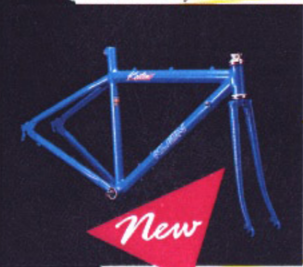
KIRSTEN .....$495 Frameset only (47 or 50cm)

MOUNTAINKLEIN. Frameset only (19, 21 & 23 inch) .....$550 The MountainKlein has become an all-terrain industry benchmark. Its ultra-light weight and superior geometry give it excellent low-speed maneuverability, high-speed tracking, shock absorption, power train efficiency and durability unequalled by any other make. Frameset includes three water bottle mounts, rear rack mounts, front cantilever bosses, fender mounts, shift cables routed through the down tube. Available in Very Fast Red or Sovereign Blue with Chrome fork.