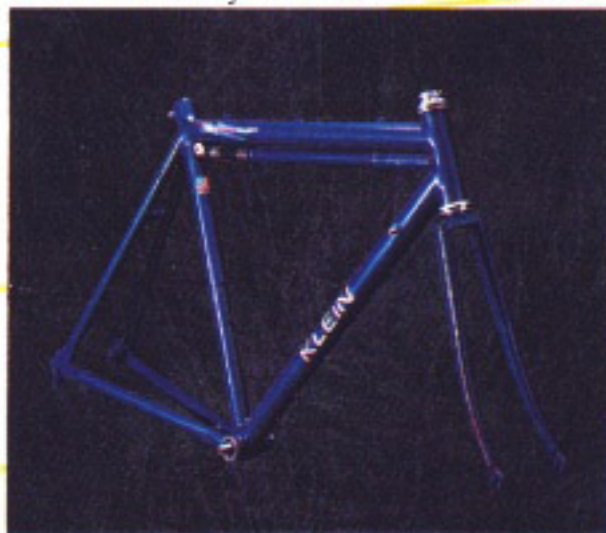
PERFORMANCE ELITE .....$595 Frameset only (even sizes 52-62cm)