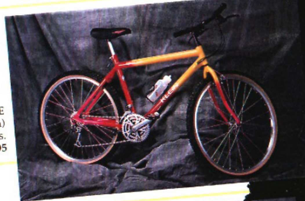
PINNACLE ELITE (18, 20 & 22 inch) approx. 24.4 lbs. $1,495