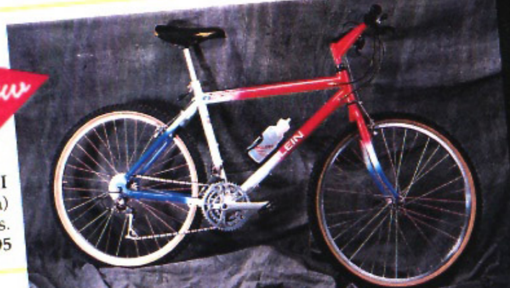
New TOP GUN XT II (18, 20 & 22 inch) approx. 24.5 lbs. $1,795