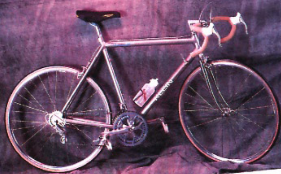
PERFORMANCE VICTORY (even sizes 52-62cm) approx. 19.8 lbs. $995

EVERY BICYCLE INCLUDES all the fittings and features of the separate frameset as well as all of the components to complete your bicycle, even down to the Klein water bottle and cage.