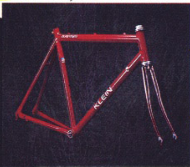
QUANTUM .....$449 Frameset only (odd sizes 51-63cm)