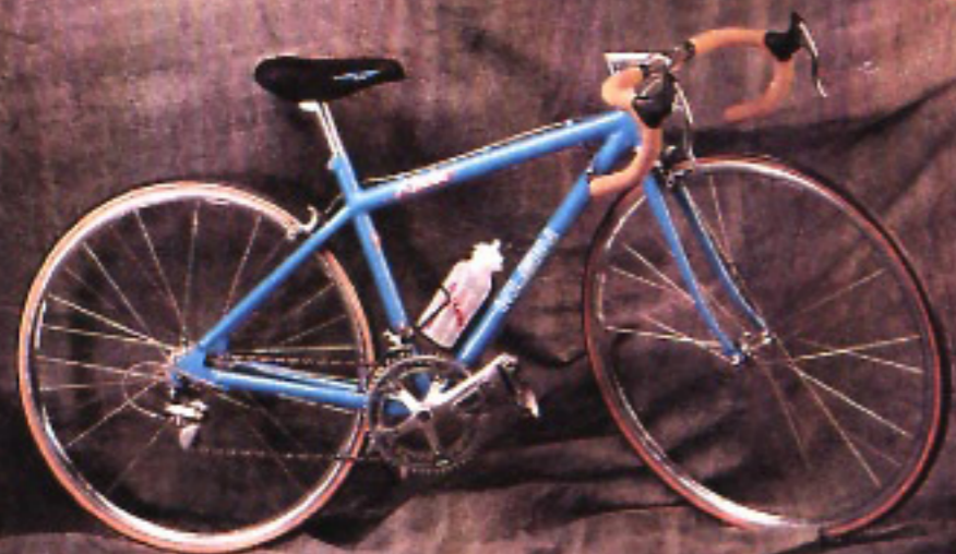
New KIRSTEN ULTEGRA (47 & 50cm) approx. approx. 19.5 lbs. $1,195