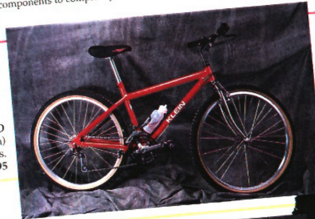
PINNACLE XCD (18, 20 & 22 inch) approx. 25.6 lbs. $995