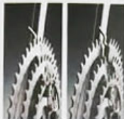
The latest version of the Browning electric shifting system is the key to the Browning's electronic shifting.

Those of you who are familiar with firearms know that for 100 years, the name Browning has