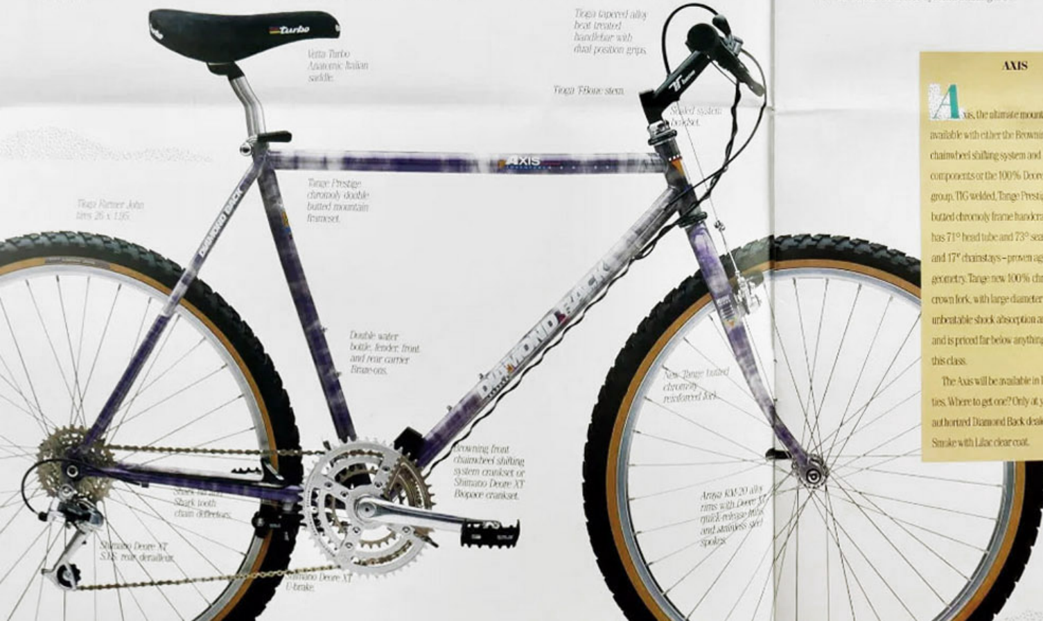
Letta Turbo Anatomic Italian saddle.

*Annual frame warranty, limited to frame.