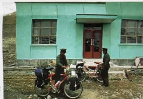
Global Dealer dealer (with check out the Diamond Back).

The Axis will be available in limited quantities. Where to get one? Only at your local authorized Diamond Back dealer. Gobs—Smoke with Libac clear coat.