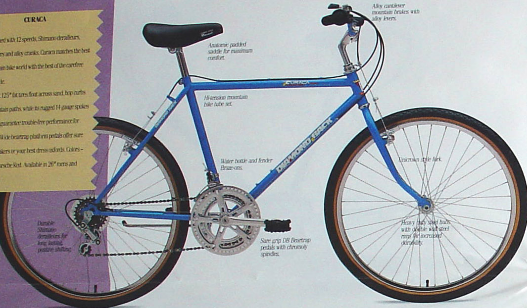
Alloy cantilever mountain brakes with alloy levers.

Durable Shimano derailleur for easy shifting, positive shifting.