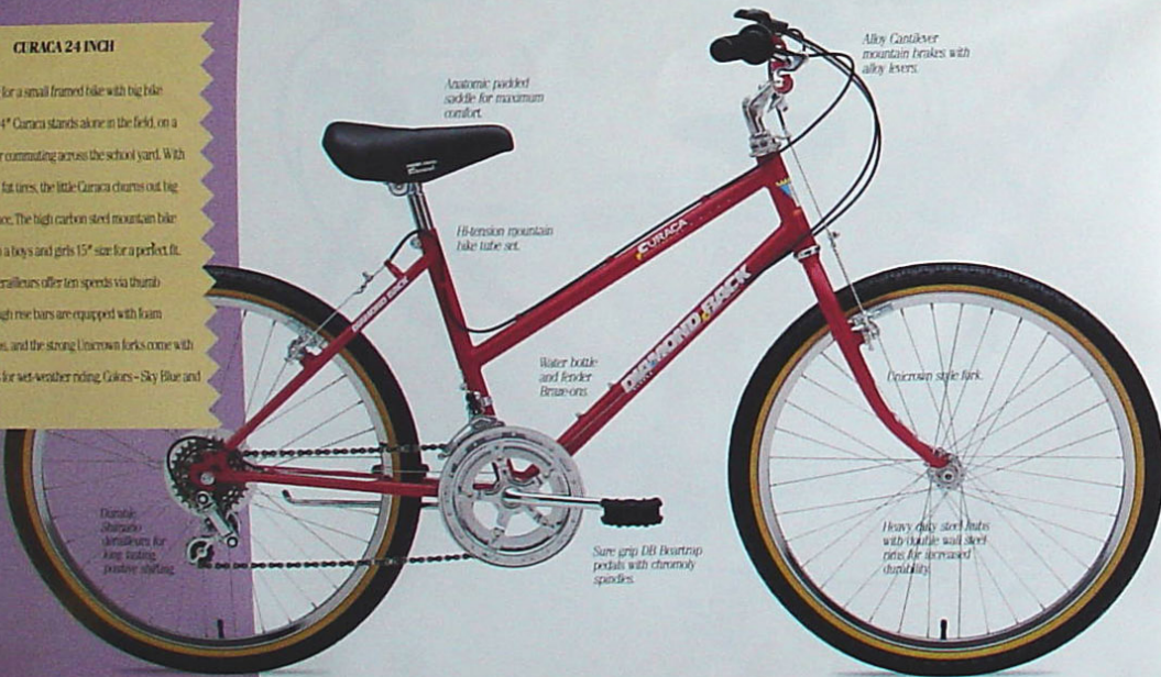
Alloy Cantilever mountain brakes with alloy levers.

Durable Shimano derailleur for easy shifting, positive shifting.