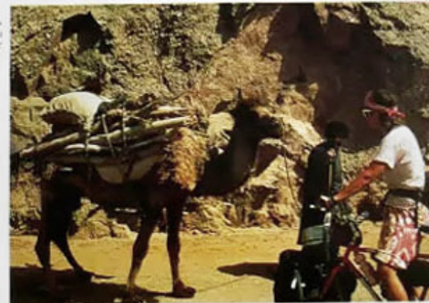
Global Dealer dealer (with check out the Diamond Back).