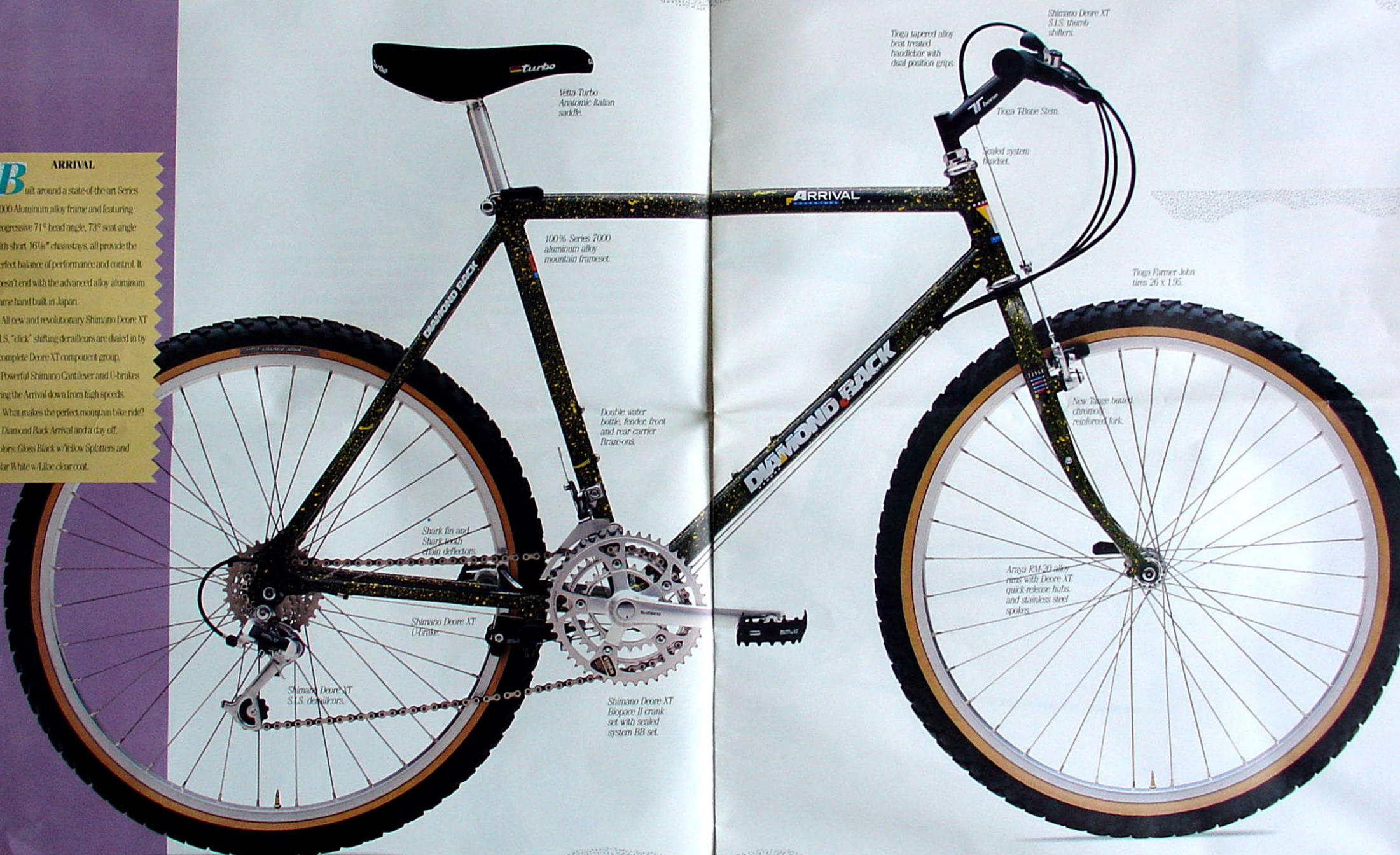
Vetta Turbo Anatomic Italian saddle.

What makes the perfect mountain bike ride? A Diamond Back Arrival and a day off. Colors: Gloss Black w/ yellow Splatters and Polar White w/ Lac clear coat.