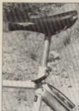
A touch of class: Builder Paul Brodie's attention to detail is flawless on the Romax. The reinforced seat lug and collar guarantee strength and durability.

see the bike come equipped with toe clips. The Brodie's less radical sloped top tube will easily allow the rider to slip the bike over the shoulder (which most bikes with a sloping top tube won't permit).