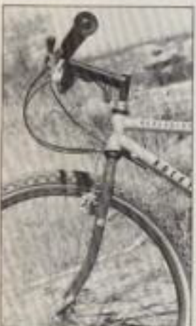
Like a kid wearing his dad's shoes: The Ritchey Race stem was about one inch too long for the Avalanche. Japanese TIG welding was of very good quality and the paint was durable.

optimum mountain bike to do all their mountain biking on—how lucky can you get? *