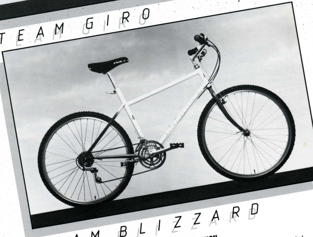
T E A M B L I Z Z A R D