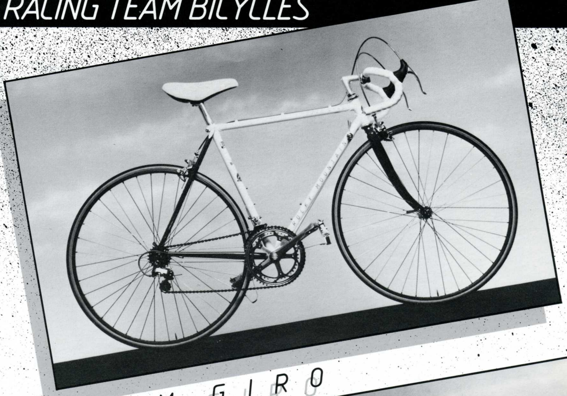
T E A M G I R O