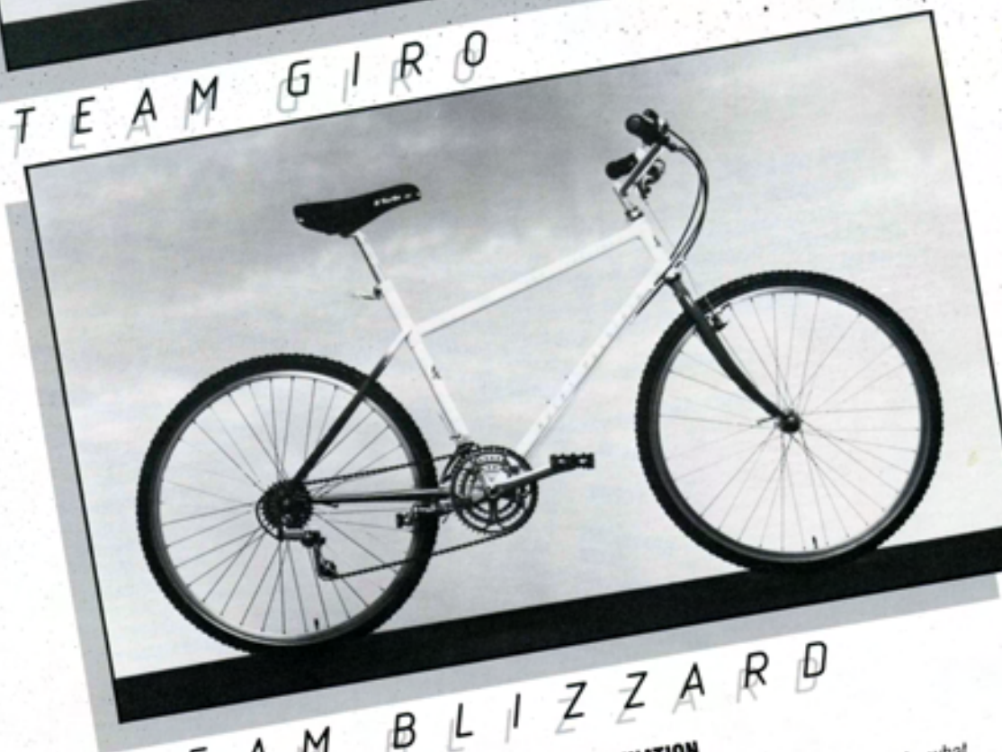
T E A M B L I Z Z A R D