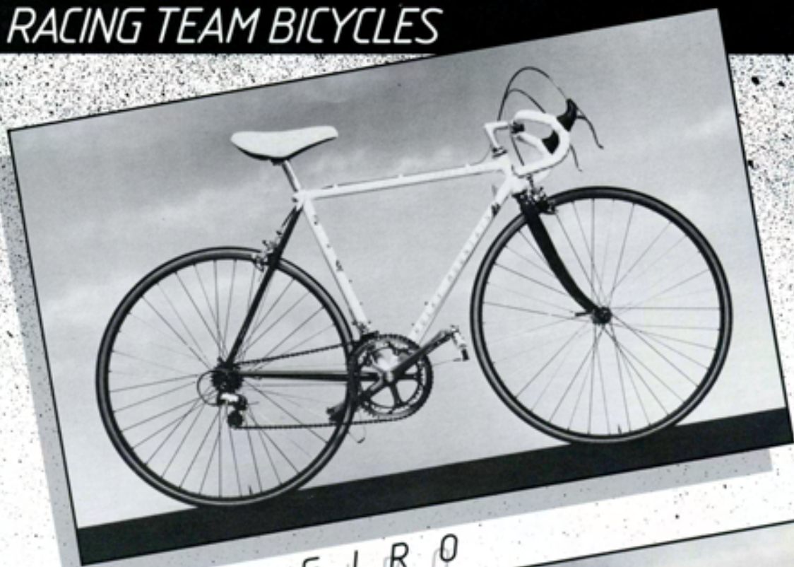
T E A M G I R O