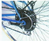
Tandem Rear Hub Brake