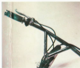
Canyon ATB Bar set