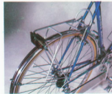
Allez! Sivalite on Super Dalesman