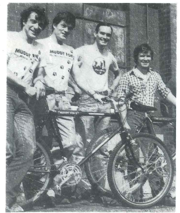
The 'In the Footsteps of Scott' Antarctic Expedition Team about to embark on their three year epic journey with their EXPLORERS.