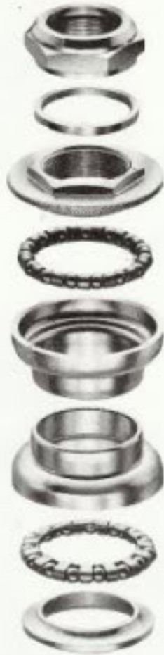
MX-600 Wrench Type