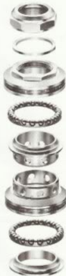
MX-4 Wrench Type with Color Bands (BLUE, RED, GOLD, BLACK)