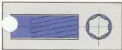
Spiral Stem Reinforced spiral ribbing to strengthen critical stress areas of the stem.