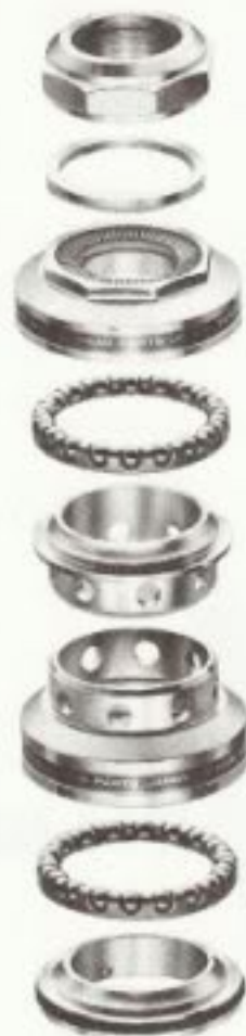
BEARTRAP-4SL Wrench Type with Color Bands (BLUE, RED, GOLD, BLACK)