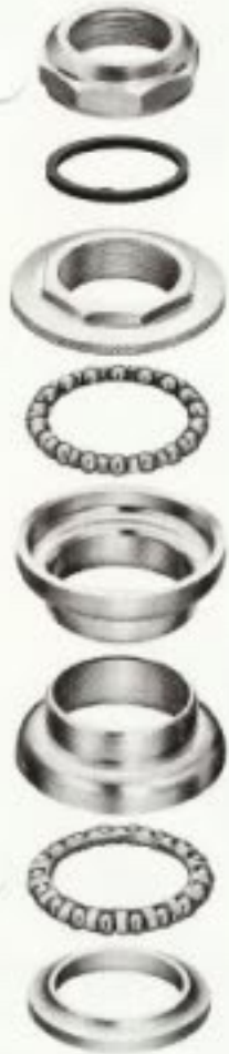
MX-1 Wrench Type with Black Washer