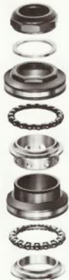
MX-6 Light Alloy Wrench Type Color Anodized (BLUE, RED, GOLD, BLACK)