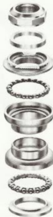
BEARTRAP-2 Wrench Type with Gold Washer