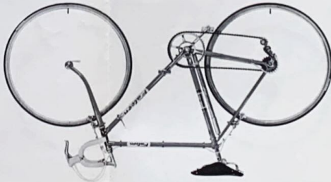
'San Remo' Mark III MODEL 92

MODEL 76 Replica of Model used by our Racing Team. Frame: 20 1/2", 21", 22 1/2", 23", 24", 25". Specialist Lugs cut and filed to our design. Reynolds 531 small flange Quick Release Hubs. Saddles: W.P.B. on Q.R. Seat Post. Brakes: Weinmann Sprints. Tires: Clement Tubulars. Spokes on quick release hubs. Chainset: Campagnolo Hubs. Saddles: Bull Leather on Q.R. Centre Pull 999. Gear: 5-Speed. Bars: G.B. Meas on Alloy Stem. 18" Inletor. Finish: Racing Blue and contrasting Panels. Chrome Front Fork Ends 6". ALTERNATIVE COLOURS: Orange with contrasting Trim. (10" - Extra). Accessories: Weinmann Q.R. Equipment. Down Tube Bottle Carrier and Bottle. Gear: Campagnolo Nuovo Record 10-speed. Seat & Stem: Campagnolo. Pedals: Bull Leather on Q.R. Chainwheel: Campagnolo with contrasting crank. Chain: Regina. Seat Pillar: Campagnolo with contrasting crank. Spokes on quick release hubs. Chainset: Bull Leather on Q.R. Butted Tubing throughout. Forks: Oval 1 1/2" x 7/8" race forged Chrome crown. Wheels: Weinmann Finish: Racing Blue, Chrome Forks and Rear Ends.