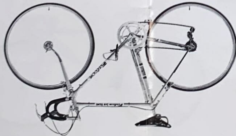
'San Remo' Equipe MODEL 76

MODEL 80 Frame: 21", 22", 23" and 24"; Reynolds 531 Tubing. Italian design frame with Continental Lugs. Wrap-over Seat Stays. Forks Chromium Plated ends. Wheels: 27" x 1 1/2" High Pressure, large flange Hubs, built with double butted spokes. Saddle: W.P.B. on Q.R. Seat Pin. Bars: G.B. on forged stem. Brakes: Centre Pull Weinmann 999 Quick Release. Pedals: Lyotard. Gear: Campagnolo Gran Sport 5-speed. Chainset: 3 Pin pattern. Finish: Racing Blue, matching accessories. Extras: 10-speed Campagnolo Gran Sport Gear.